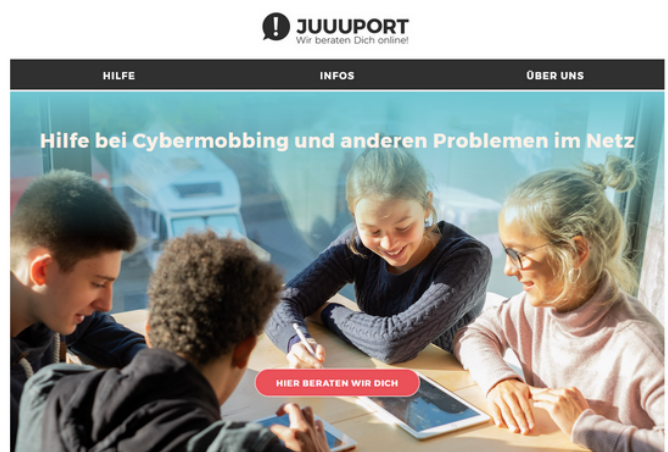
„Wir, die JUUUPORT-Scouts ...“

The association trains young people to become JUUUPORT Scouts, who are involved in the project. During the training sessions, the Scout candidates learn the most important basics for their voluntary counselling work from experts in the fields of law, internet and online counselling. The Scouts help their peers with problems and give online seminars.